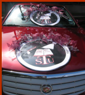
First Place Decorated Car Division